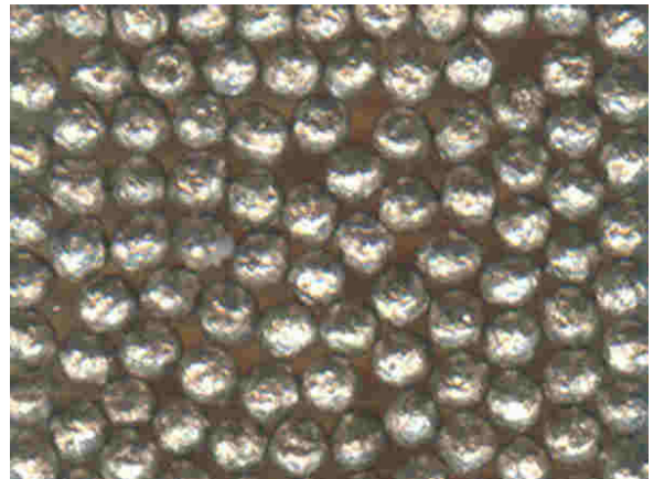
Above G3 - Spherical Conditioned