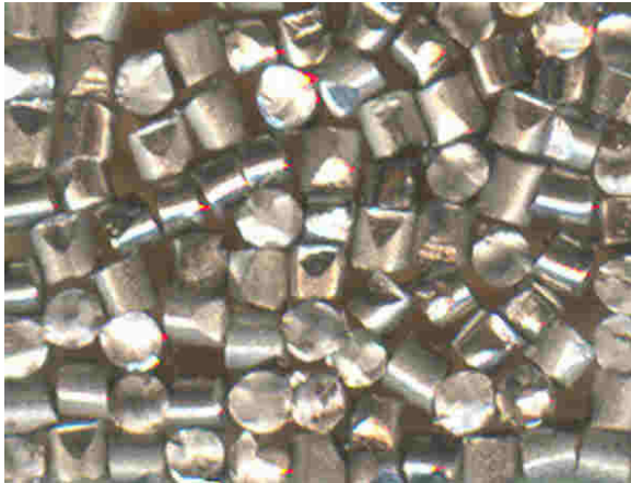
Above G0 - As Cut